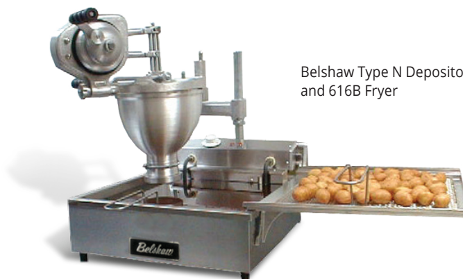
Belshaw Type N Depositor and 616B Fryer